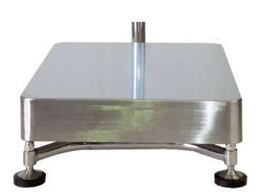
Heavy Duty Design